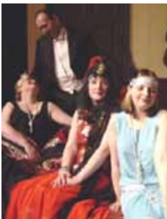
Hay fever - June 2003