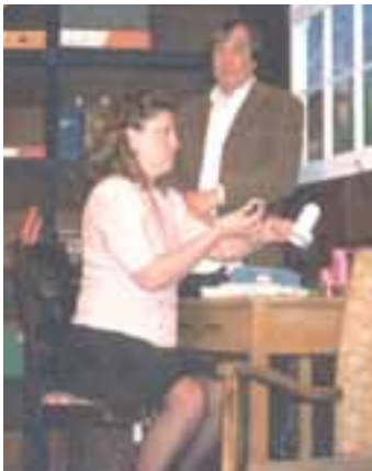
Educating Rita - May 2003