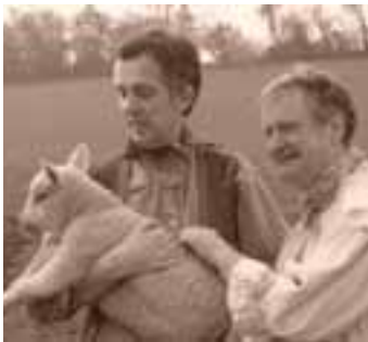
Far From The Madding Crowd March 2003